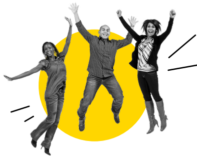
An expert team