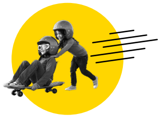
Fast working capital access

Lots of high-growth businesses need finance to support their ambitions, especially where payments are deferred over a long period of time. Often there are few working capital options available, and this is where Receivables Finance could be the solution. It works by advancing cash against deferred payments under your sales contracts, therefore providing a financial safety net for your business. When you want to push on with your next project, there's no need to wait for customer payments first.