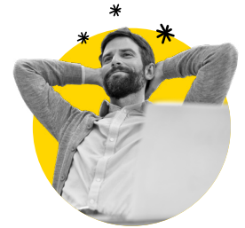
Peace of mind with contracts